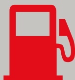
GASOLINE & GASOIL